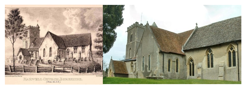
The picture on the left dates from 1843; the one on the right is a recent photo. The building hopefully will still retain its appearance in another 150 years, but there are a few differences to spot that show that it is not just a piece of history!

The village has been here for a thousand years and the church for nearly all of that time. Widening our circle of Friends of St. Matthew's could really make a difference to its future. To have that extra support would be wonderful.